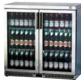
Stainless steel polished